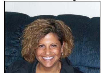
Lynn Massachusetts, Age 44

“God has chosen me to be His and has blanketed me in His love. I know He has a plan and a purpose for my life that is greater than my dreams. I am no longer alone. I have my children in my life and am an important part of the family of God at Place of Promise.”